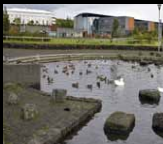
Landmótun landmotun.is Lækurinn