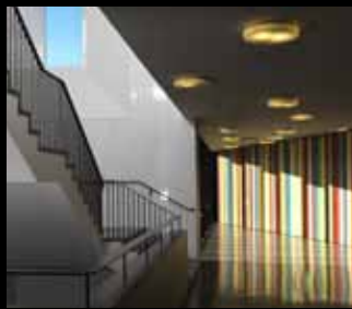
Kurtogpi kurtogpi.is Borgarfjörður High School