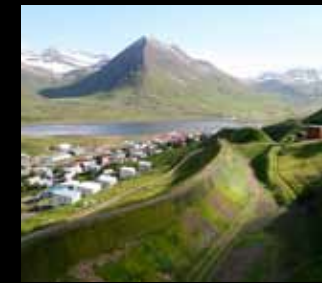
Landslag ehf landslag.is Sigluf. Avalanche barriers