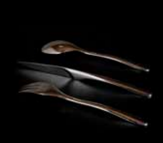
Dögg Design doggdesign.com Hekla & Kína