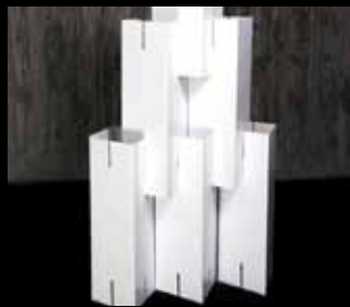
Friðgerður Guðmundsdóttir studlar.wordpress.com Stuðlar