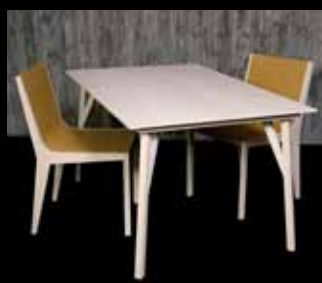
Go Form goform.is MGO 182 & MGO 500