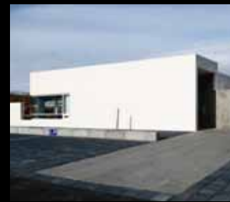
pk arkitektar pk.is Birkimörk