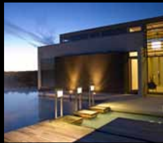
VA Arkitektar vaarkitektar.is Blue Lagoon Clinic