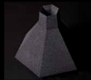
Jón Björnsson bjoss.com Flower Eruption