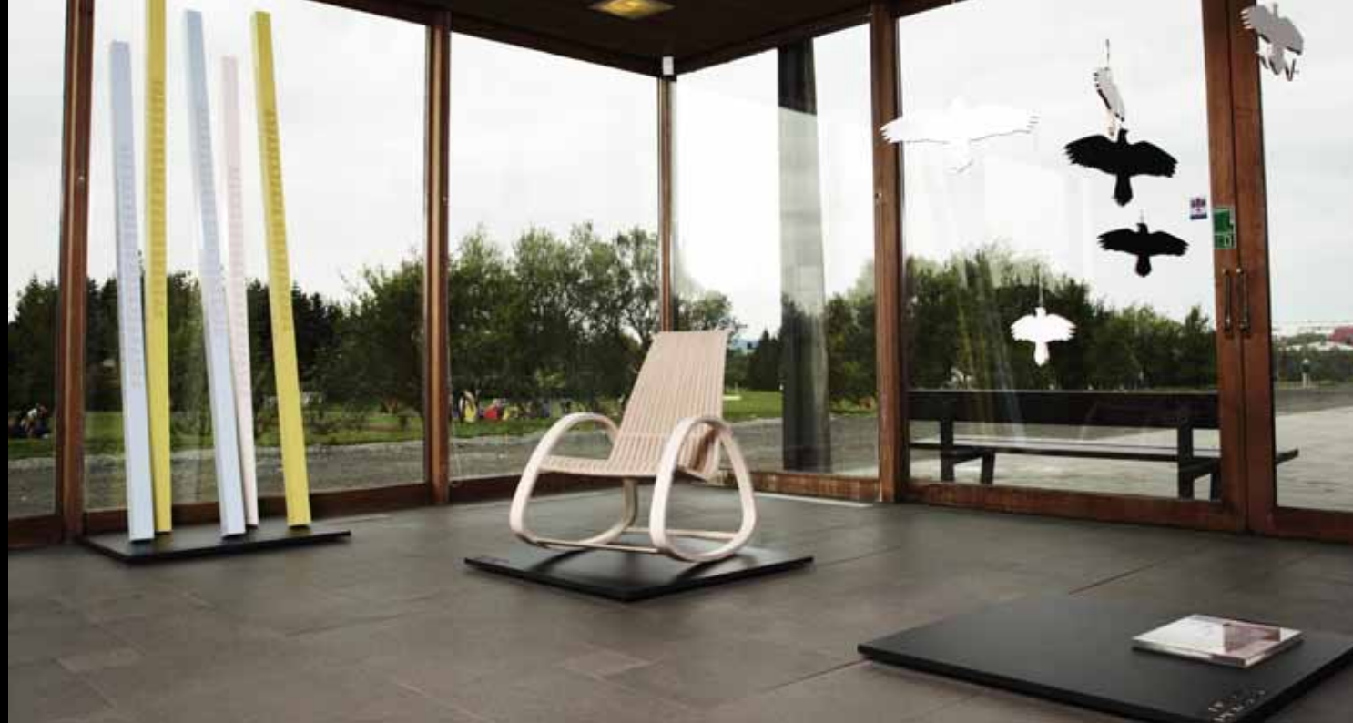
The exhibition first opened at Kjarvalsstaðir Art Museum for the Reykjavík Arts Festival in 2009

Icelandic Contemporary Design is a travelling exhibition and was first opened at Kjarvalsstaðir, Reykjavík Art Museum for the Reykjavík Arts Festival in 2009. The exhibition is organized by the Iceland Design Centre in collaboration with the Icelandic Ministry of Foreign Affairs, the Icelandic Ministry of Education, Science and Culture, the Icelandic Ministry of Industry, Aurora Design fund, Icelandair and Visit Reykjavík.