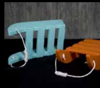
Dagur Óskarsson daguroskarsson.is Dalvík - sled