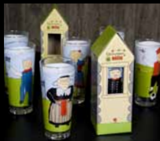
Stella Design stelladesign.is My family