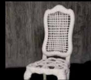
Guðrún Lilja Gunnlaugsd. bility.is Visual inner structure