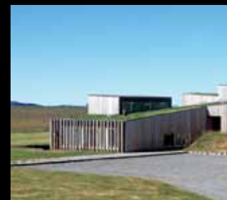
Studio Granda studiogranda.is Hof Country residence