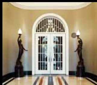
+Arkitektar plusark.is Hótel Borg renovation