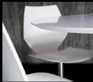
Erla Sólveig Óskarsdóttir ag.is Sproti & Spuni