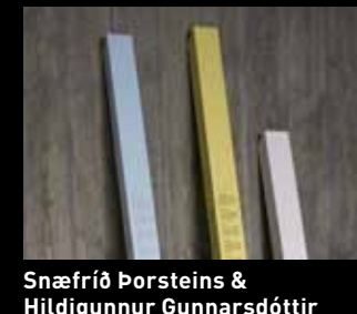
Snæfríð Þorsteins & Hildigunnur Gunnarsdóttir snaefrid.is hildigunnur.is 2922 days